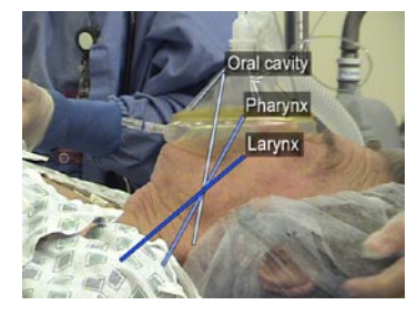
Figure 2. The "sniffing" position

In many cases, a neuromuscular-blocking agent and a potent sedative are needed to facilitate intubation. These agents will improve your visualization of the vocal cords and prevent the patient from vomiting and aspirating gastric contents.<sup>3</sup> If you plan