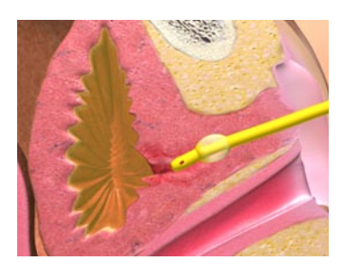
Figure 4. Partially Inflated Balloon in Urethra.